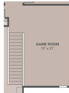
Opt. Game Room

Opt. Game Room Opt. Bedroom #4 Opt. Bath #3