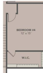
Opt. Bedroom #4