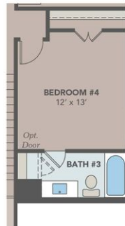
Opt. Bedroom #4 with Opt. Bath #3